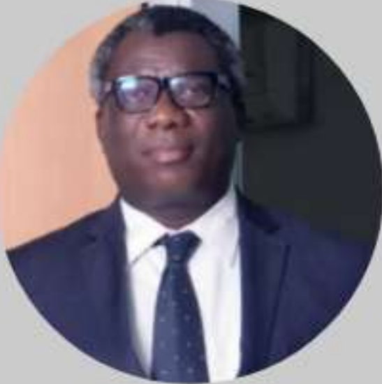
Legal Officer/Executive Advisor to the CEO