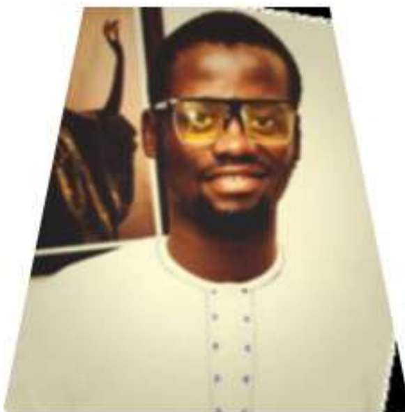
Programs Director and Head of Media